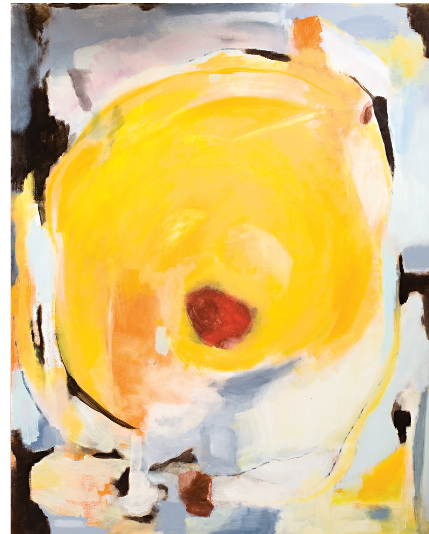
Seizure (oil on wood panel, 5x4 feet)