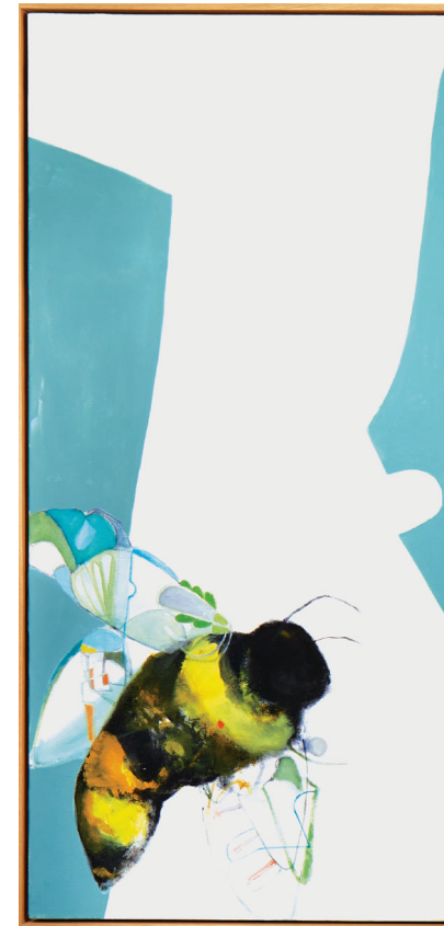
Hive (oil on canvas, 7x5 feet)