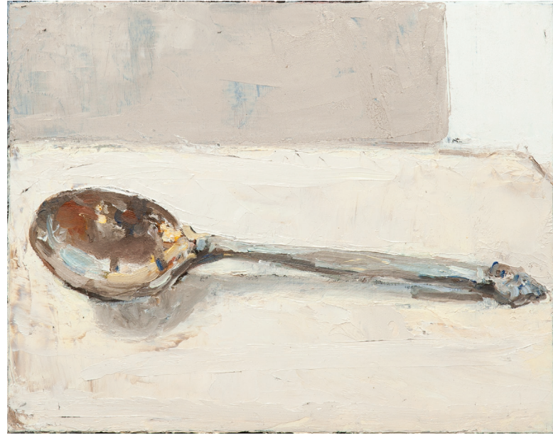
Several years ago, in response to a breakup, Schwartz created a series of paintings of a single spoon, which she calls “Single Serving.” Single Serving: 221017 (left; oil on board, 9x7) and Single Serving: 081117 (right; oil on board, 9x12) are two examples. Feeling very much alone, the artist identified with a cast-off spoon she found in the street. Read writer Lawrence Weschler’s response to seeing the series, “The Art of Spooning,” which was published in The Paris Review at bit.ly/the-art-of-spooning .