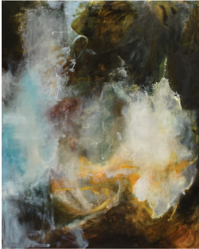
Clayfellow (oil on wood panel, 5x4 feet)